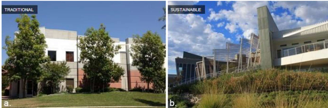
Figure 1. (a) Example of a “traditional” design solution for a commercial landscape in southern California, as compared to (b) a “sustainable” design solution at the Frontier Project in Rancho Cucamonga, CA (2012).

To maintain consistency in format, all case studies contain the following content: basic project information; project overview; significant design challenges; significant design solutions; quantified performance benefits; a list and description of all sustainable features; at least one cost-comparison (between a sustainable and traditional feature/practice); a list and description of lessons learned during project design and implementation; project photos (illustrating before and after or traditional versus sustainable conditions) (Figure 1); supporting images (site plan, additional photos, diagrams, etc.); and a methodology document that includes data sources and calculations for each performance benefit.